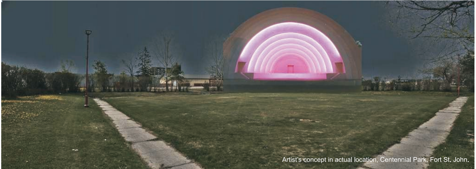
Artist's concept in actual location, Centennial Park, Fort St. John.

Fort St. John has matured significantly in recent years. Planning has included infrastructure that contributes to the quality of life in the city.